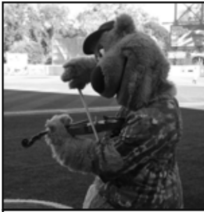
Sluggo! Please put down the family heirloom!

On July 13th, it was Arts Umbrella night at PK Park!