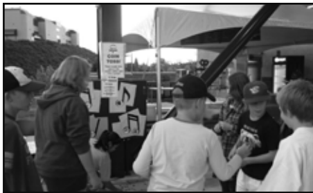
They shoot, they score! Kids went nuts over our coin toss game in the concourse!

Special thanks to the Ems for their generosity and for reaching out into the community. Extra thanks to all of you who came out to support AU at the game and to