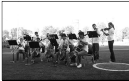
Oh say can you see? YS and JO student musicians perform the National Anthem.

all of our fantastic student participants! It was certainly a fun night!